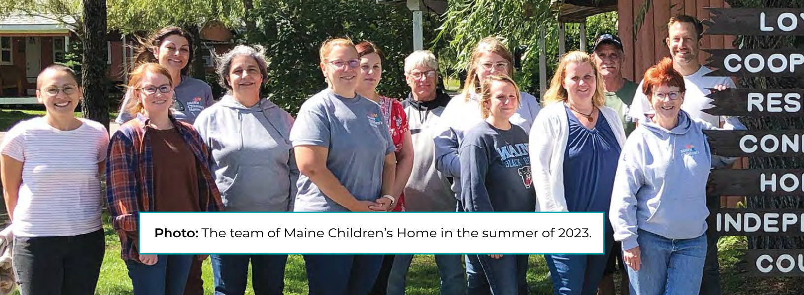
Photo: The team of Maine Children's Home in the summer of 2023.

Maine Children's Home utilized unrestricted endowment funds to support organization cash flow and to invest in much needed campus upgrades and repairs. In-Kind support is reported as revenue but is a non-cash transaction. Expenses were up in 2023 from 2022 with increases in staff salaries, increased occupancy costs (heat, electricity), and strategic investments in community and donor engagement.