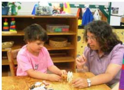
Grouping and classifying objects is one of the experiences that helps a Preschooler build competence in math

The Children’s Place provides early childhood care and education to children 0-5 years old. Currently, 58 children are cared for each day.