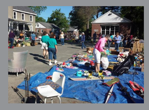
The Friends put together the Annual Yard Sale which benefits the Summer Camp Program

<u>The Friends of Maine Children's Home</u> is a service organization comprised of individuals committed to providing support to all the core programs at The Maine Children's Home through volunteerism and fundraising. They meet once a month to plan and organize projects and are an important presence at Maine Children's Home events. The Friends meet on the first Tuesday of every month at 6 PM on our campus and are always welcoming new members!