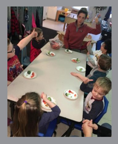
"Thumbs up" to tasting broccoli, carrots & red peppers

As a result of this 6-week program, teachers at The Children's Place have additional tools to enrich the science, math, literacy, health and nutrition curriculum in their classrooms.