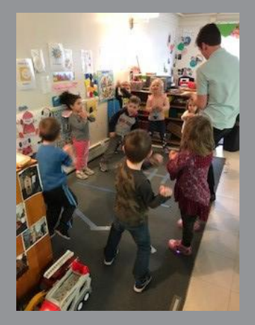
Movement: picking vegetables in our garden