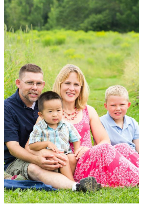
The Whittaker family recently worked with The Maine Children's Home's adoption team.

Please reach out to Lindsay and the adoption team if you think adoption might be a goal for your family. It's never too early to start planning and researching. We are pleased to share that we have a new lending library in the suite of offices in the Parks Building on campus.