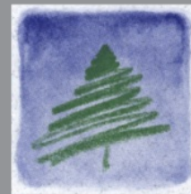
THE BINGHAM PROGRAM

The Harland A. Turner Family Counseling Center has been given a $5,000 grant from The Bingham Program to help provide the best-quality counseling for children who have had adverse childhood experiences (abuse, extreme neglect, significant loss, trauma).