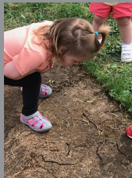
Looking for worms, frogs & bugs