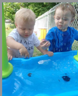
Splashing, scooping & pouring water