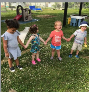
Playing with friends

The Children's Place Early Care & Education Center's has been enjoying the summer with lots of outdoor play! Take a look at all the fun things our babies and toddlers have been doing!