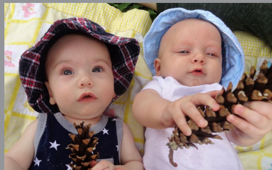
Babies & nature

Teaching children about the natural world should be seen as one of the most important events of their lives.