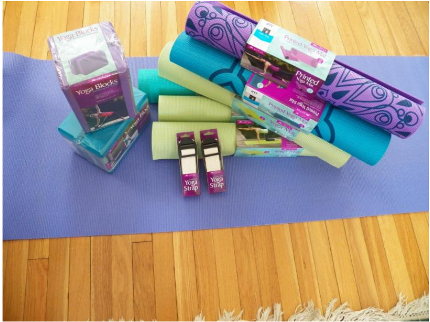
Yoga supplies donated to the Teen Parent School Program.