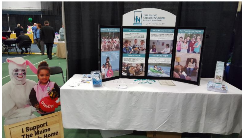
The Maine Children's Home recently participated in the Mid-Maine Chamber of Commerce Business to Business Showcase.