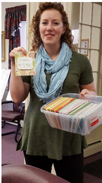
A very warm thank you to the Augusta Kiwanis Club for the handmade birthday cards for the