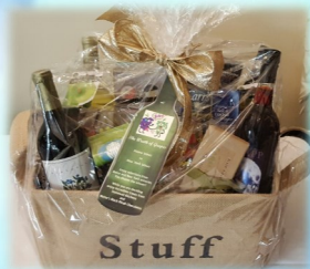
Two of the beautiful gift baskets offered as Silent Auction items at our Annual Celebration.

We are deeply thankful for the incredible support we have received to accomplish our goals and to serve over 3,000 children, youth and families across our programs. You are helping us to create more loving and healthy homes all across the state of Maine every day.