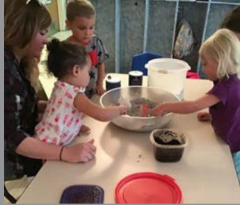
measuring in cooking