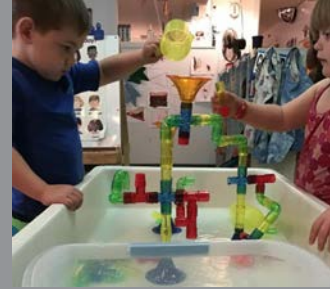
geometry & spatial sense

The skills developed through authentic, interdisciplinary STEAM learning experiences in the early years, provide children with opportunities to develop critical thinking, executive functioning and problem solving skills that support school readiness and successful life-long growth and development. Click here for more information on STEAM.