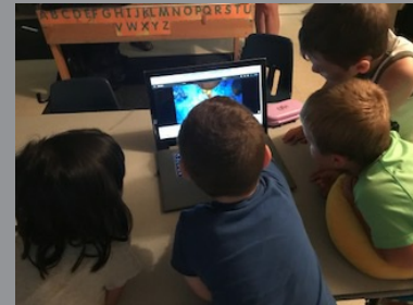
research using computer