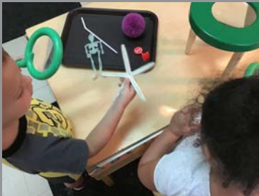
exploring with magnifying glass