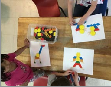
partnering with parquetry pieces